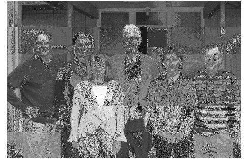
Woodway Town Council

Building & Municipal Services: Discussed updates to Woodway