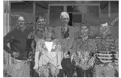
Woodway Town Council

Building & Municipal Services: Discussed updates to Woodway